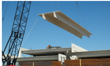
Prefabricated / Modular