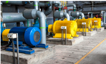
Plant / Equipment Installation