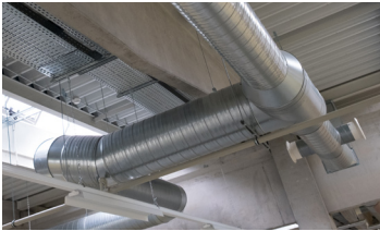
Mechanical / Plumbing